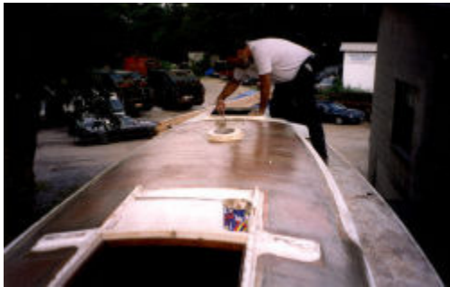
Complete Deck Re-Core