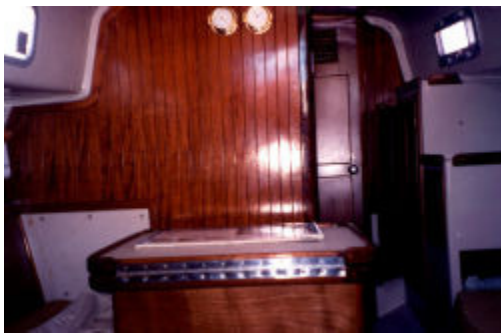
Table & Bulkhead