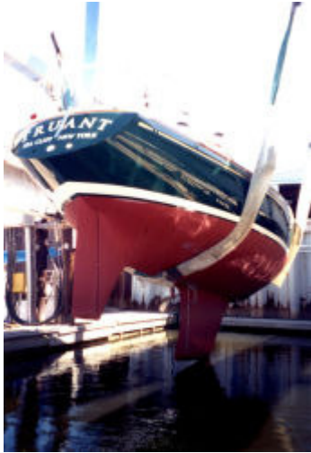
Stern Quarter View