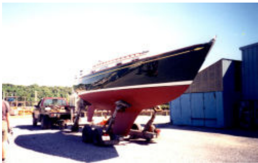
STBD Bow View