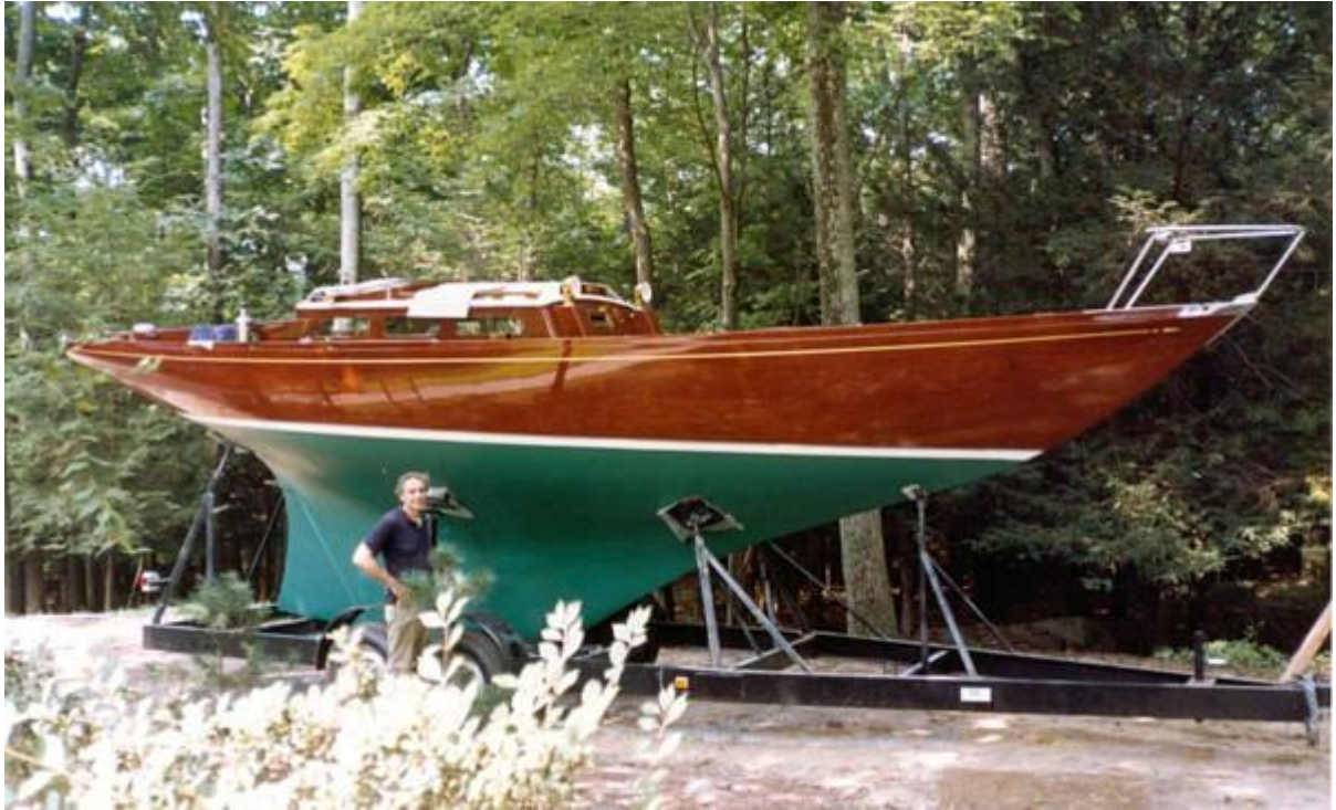
Stormy (on Trailer)